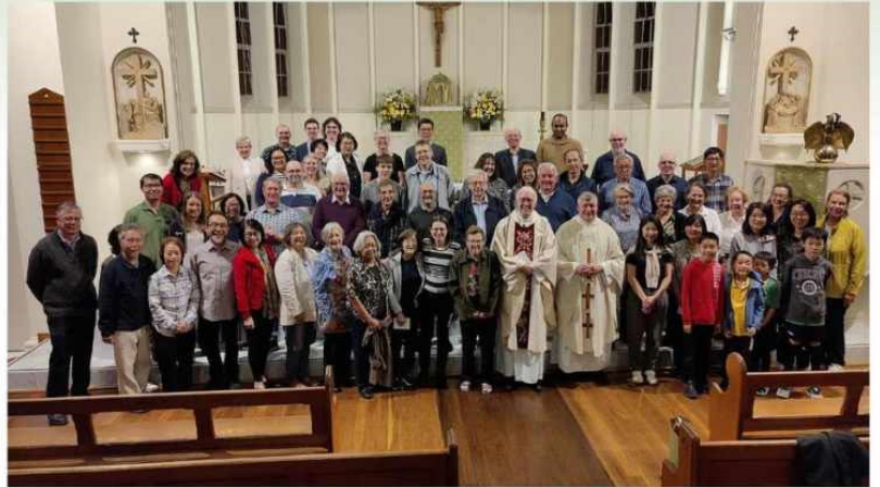
Thank You Evening for Volunteers last Tuesday