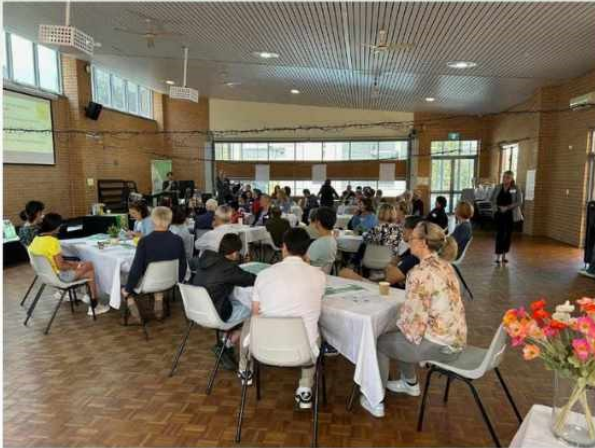
The Synodal Assembly in Maa Killap Hall last Sunday morning